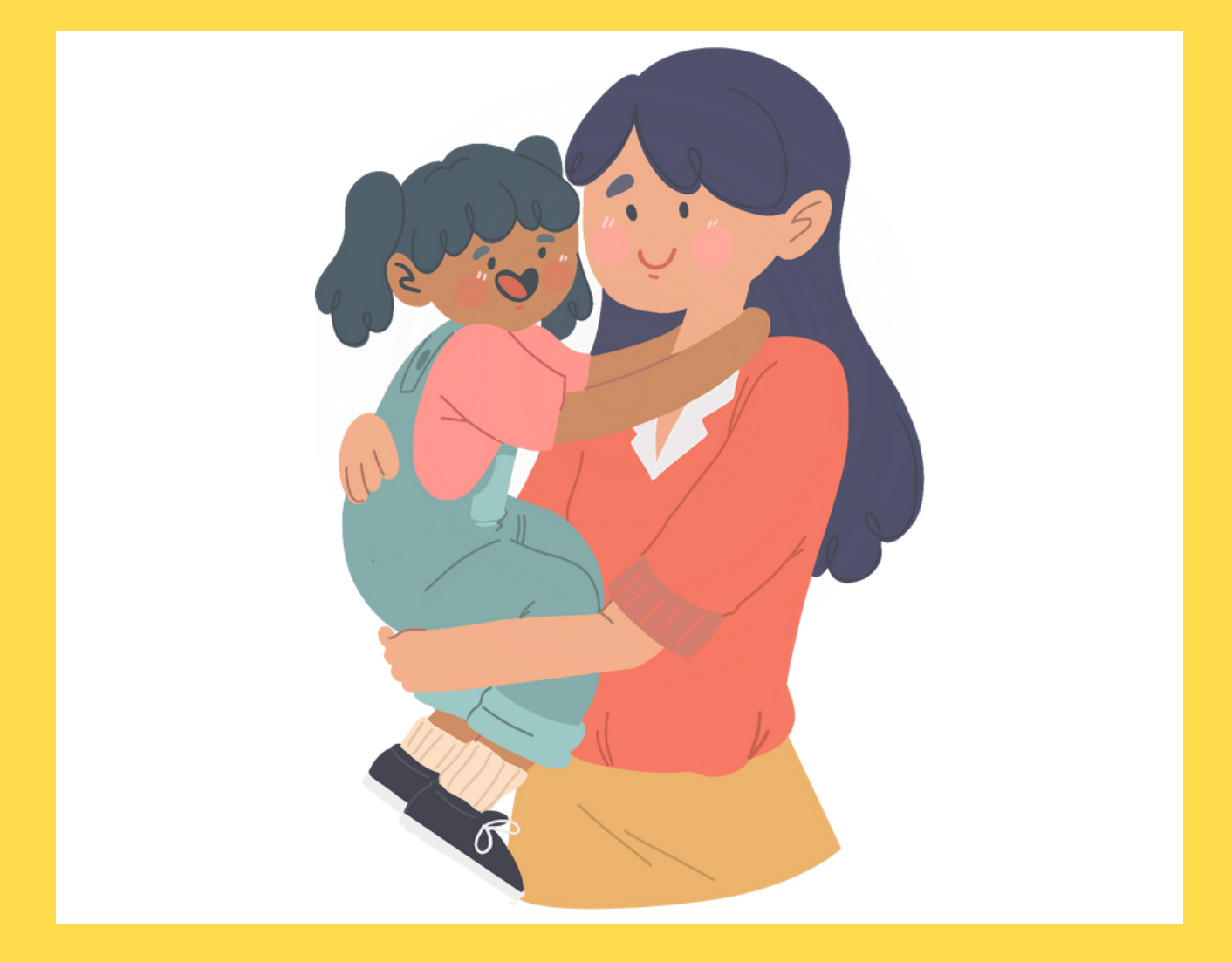
My adult is in the lobby, but I know that they are close by and I am safe.