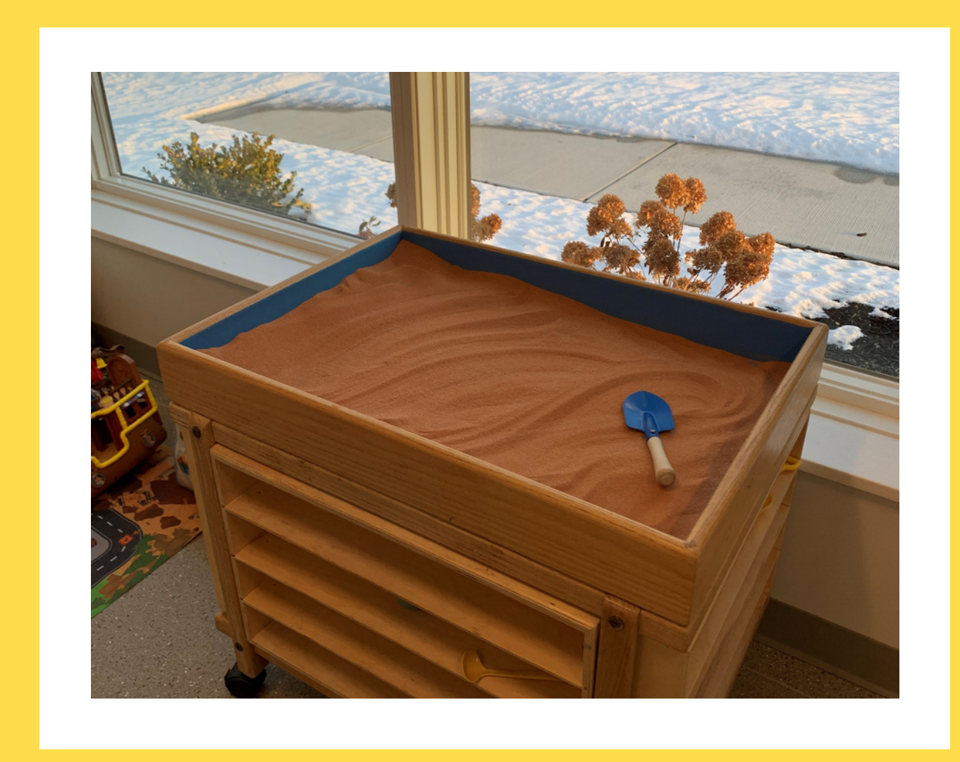
Sometimes I choose to play in the sand table.