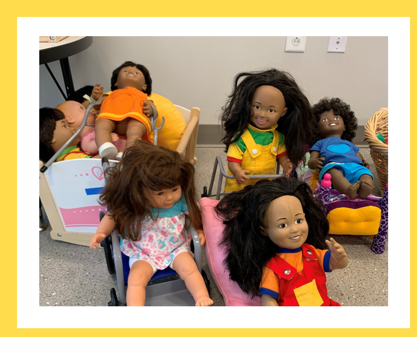
Sometimes I choose to take care of the dolls.