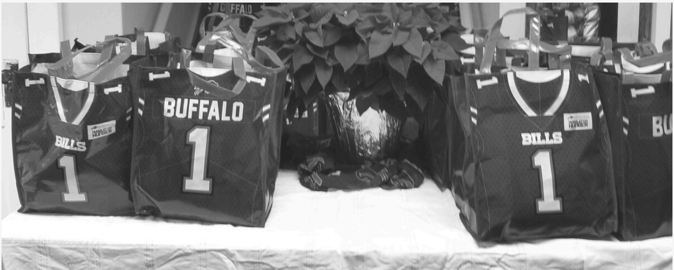
Above: Buffalo Bills Foundation Community Christmas