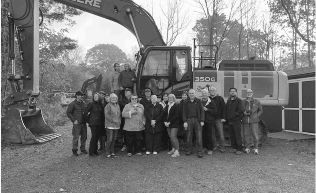
Above: Founders & board members meet to celebrate the groundbreaking.

As we close out 2021 we find we are looking forward to a busy year ahead and look back with gratitude. Although we have made great progress, we have far to go to complete the Scott Bieler Rural Outreach Center.